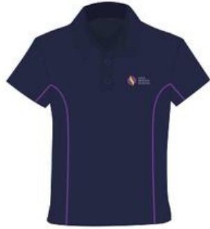
PET-SHIRT PRIMARY Unisex