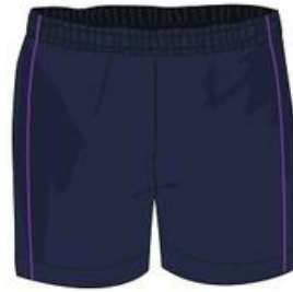
PE SHORTS PRIMARY Unisex