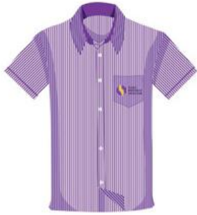
STRIPED SHIRT Boys