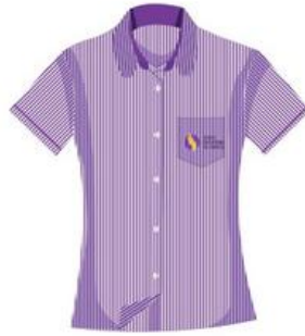
STRIPED BLOUSE Girls