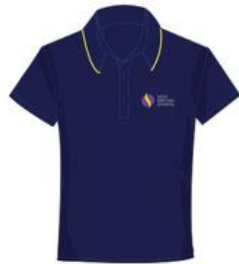
POLO SHIRT Unisex