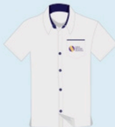
BLUE COLLAR SHIRT KS4