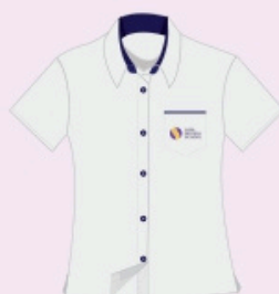
BLUE COLLAR BLOUSE