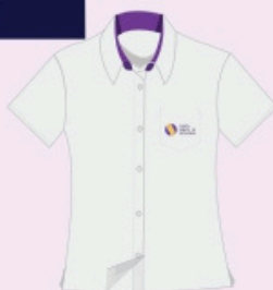
PURPLE COLLAR BLOUSE