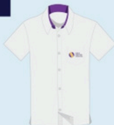
PURPLE COLLAR SHIRT KS3