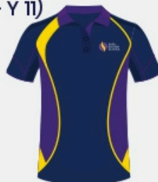
PE T SHIRT