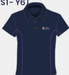
PE T SHIRT